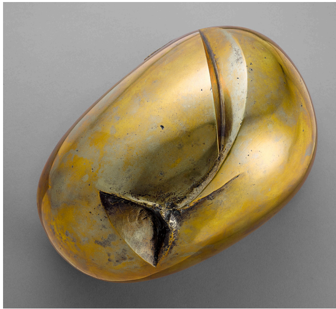
Constantin Brancusi The First Cry, c. 1914; cast 1917 brass Overall: 19.5 × 24.5 × 16 cm, 25 lb. (7 11/16 × 9 5/8 × 6 5/16 in., 11.3 kg) Art Gallery of Ontario Purchased with assistance from the Volunteer Committee Fund, 1981 81/142 Romanian, 1876 - 1957